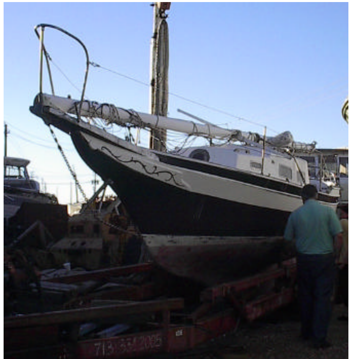
Sailing Vessel "Doris Too"